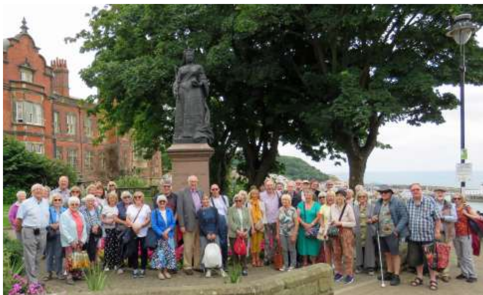
Wakefield and Scarborough Civic Society members together in Scarborough.

I accepted an invitation to Hull Civic Society's 60 th anniversary celebration at the Charterhouse – a hidden gem in the heart of